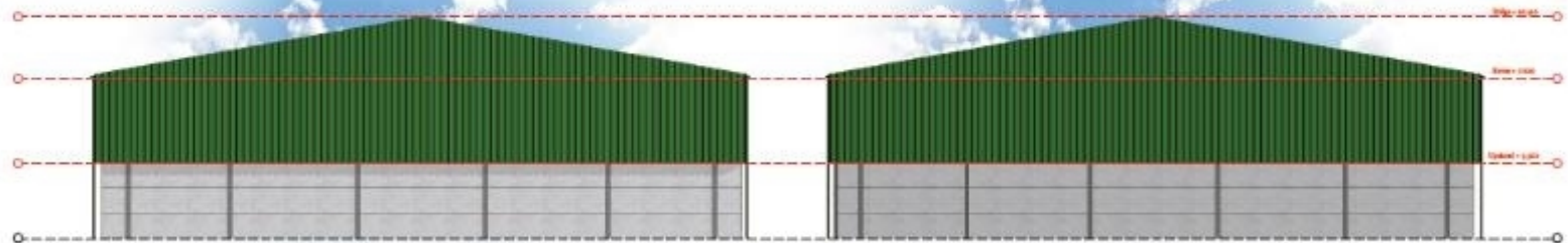
3 PROPOSED LEFT ELEVATION 1:1000