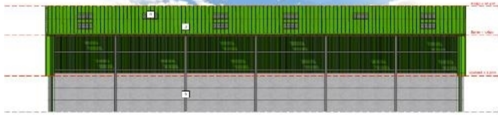
1 PROPOSED FRONT ELEVATION 1:1000