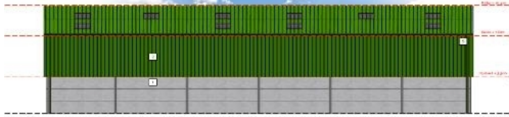
2 PROPOSED REAR ELEVATION 1:1000