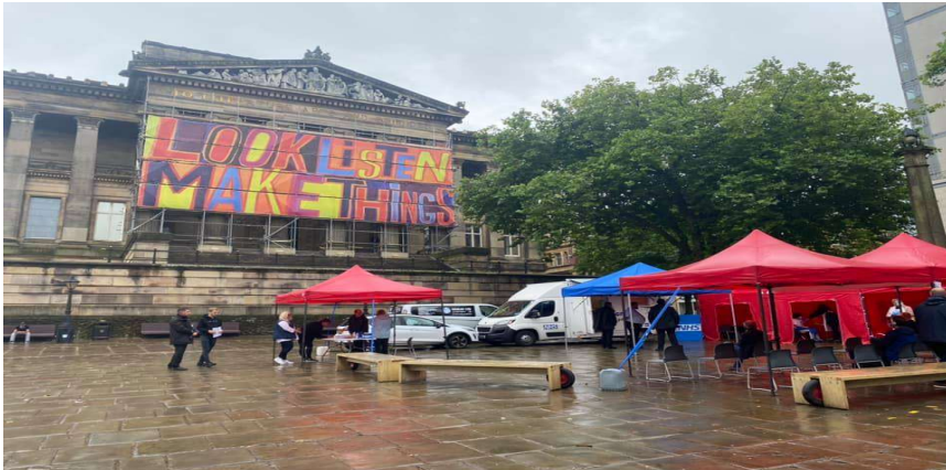
Vaccine Van teams at Preston City Centre