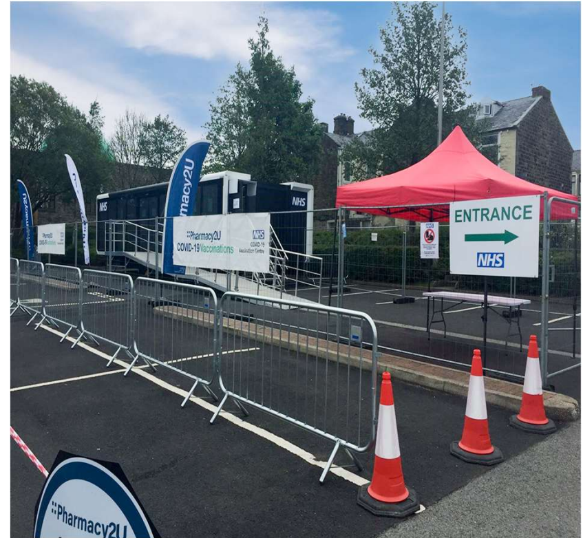
Mobile Artic Lorry site in Nelson, preparing to open to members of the public.