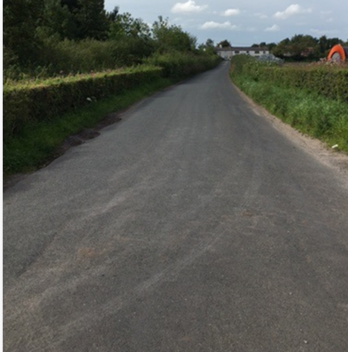
Gorst Lane (west)