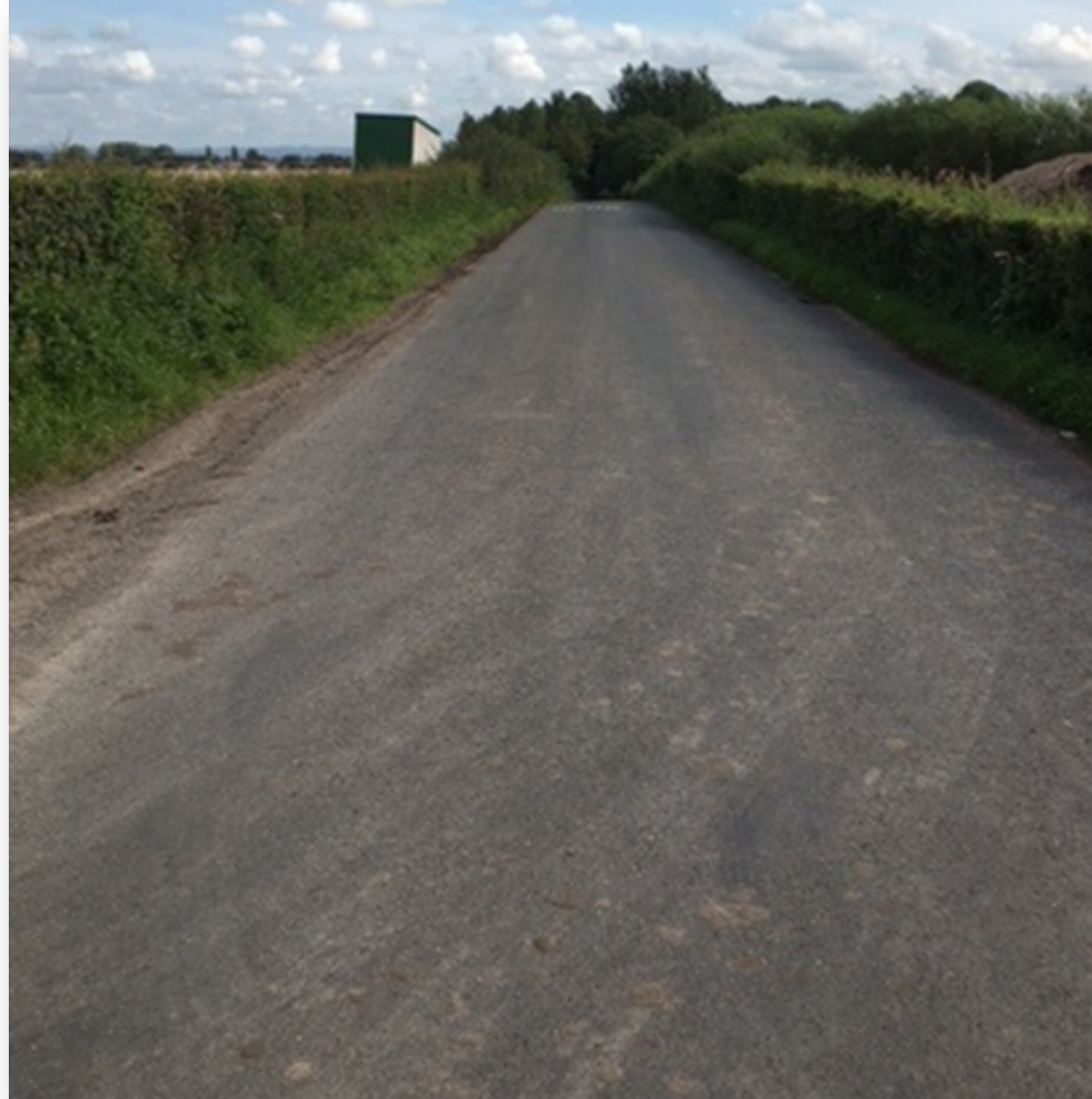
Gorst Lane (East)