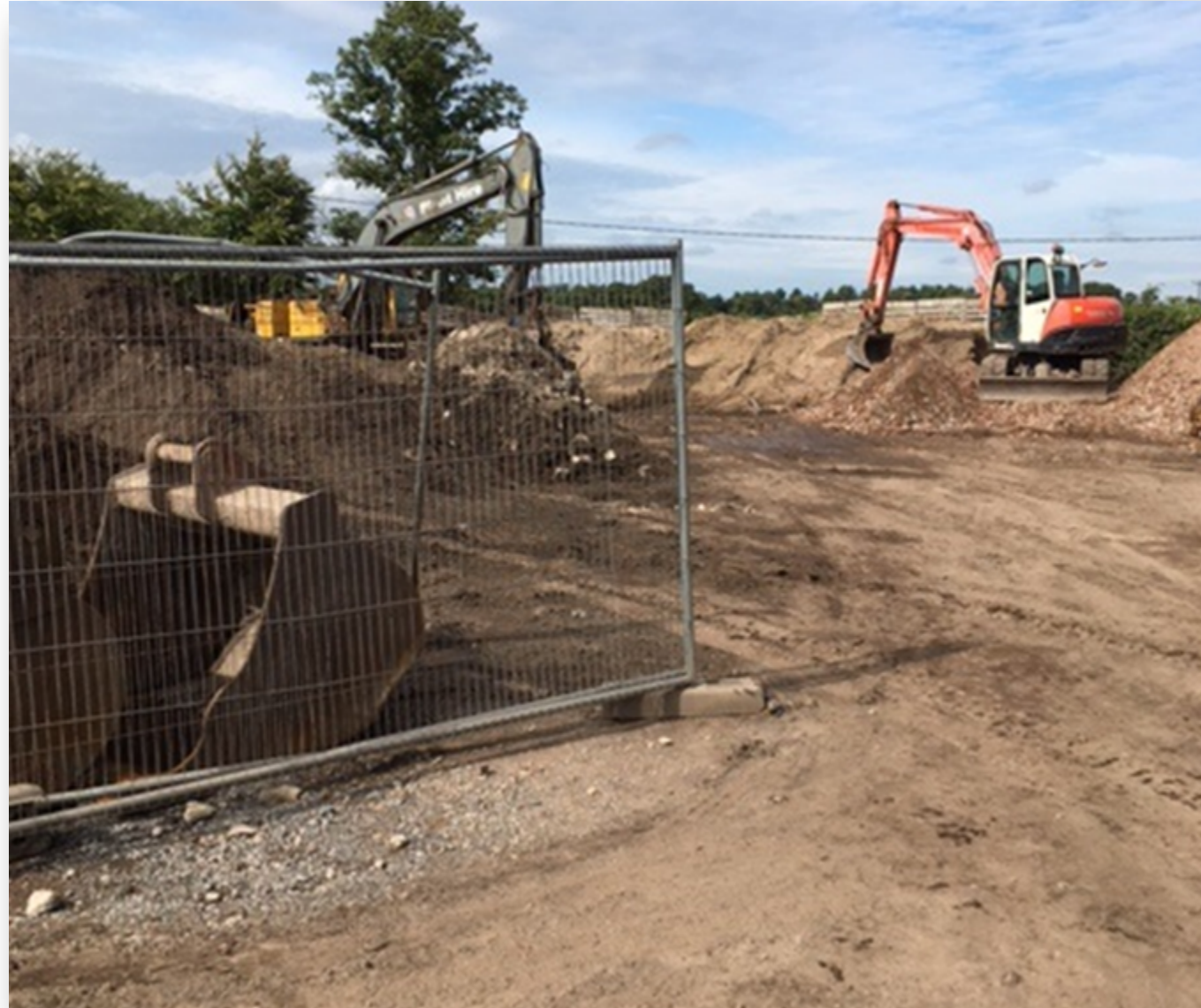
Waste management area