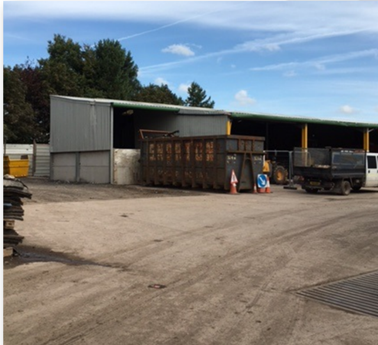
Waste management building