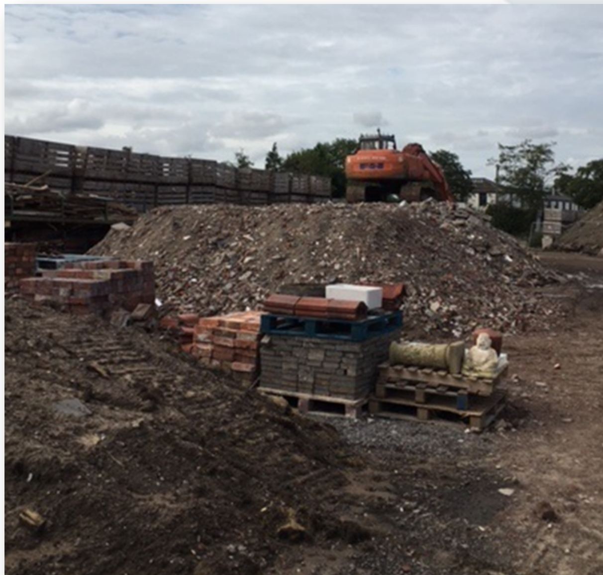
Existing outside inert storage (to be removed)