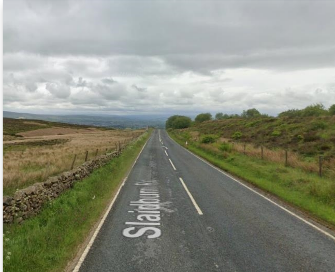
Slaidburn Road heading down to Waddington