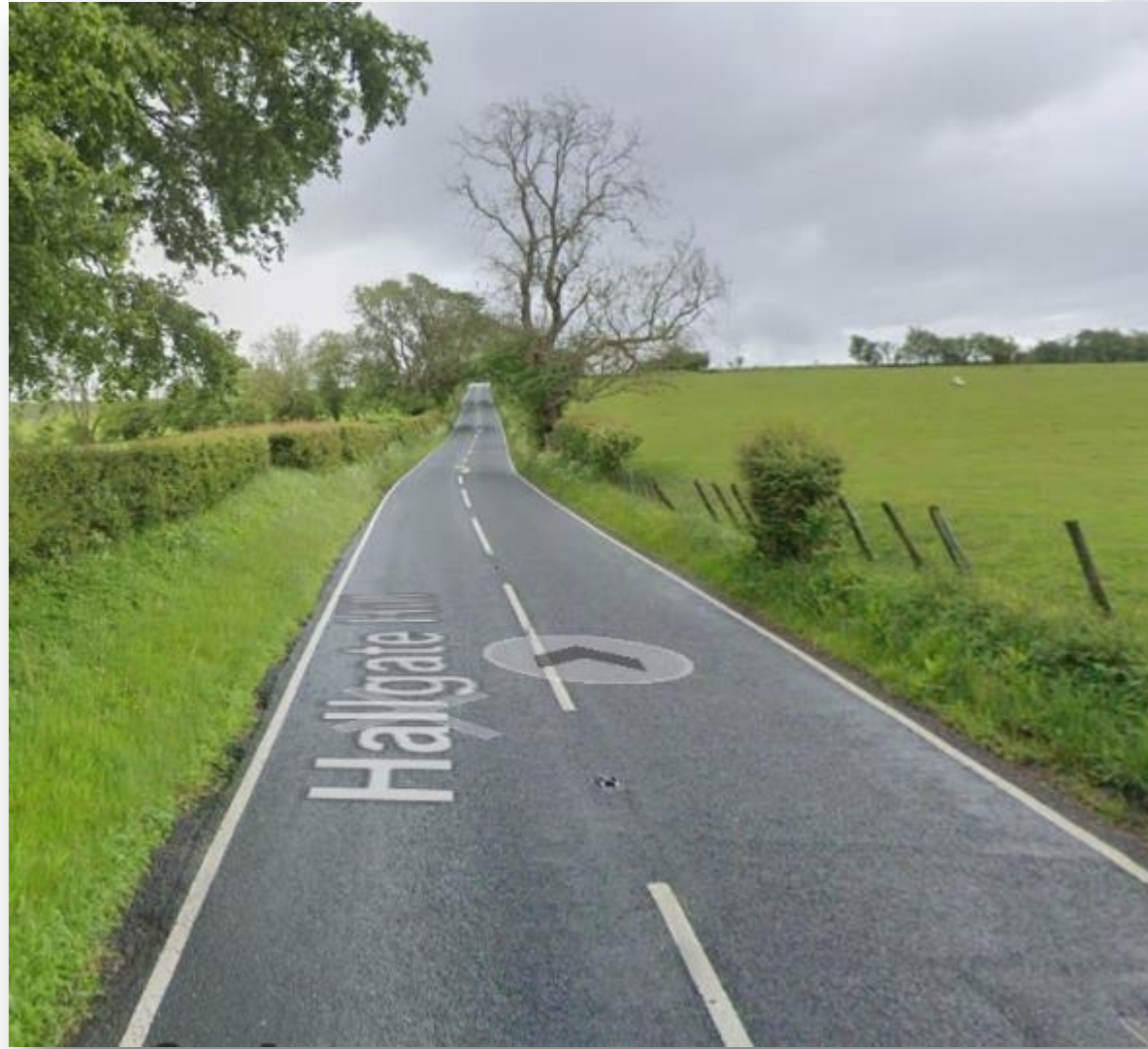
Hallgate Hill rising up from Newton