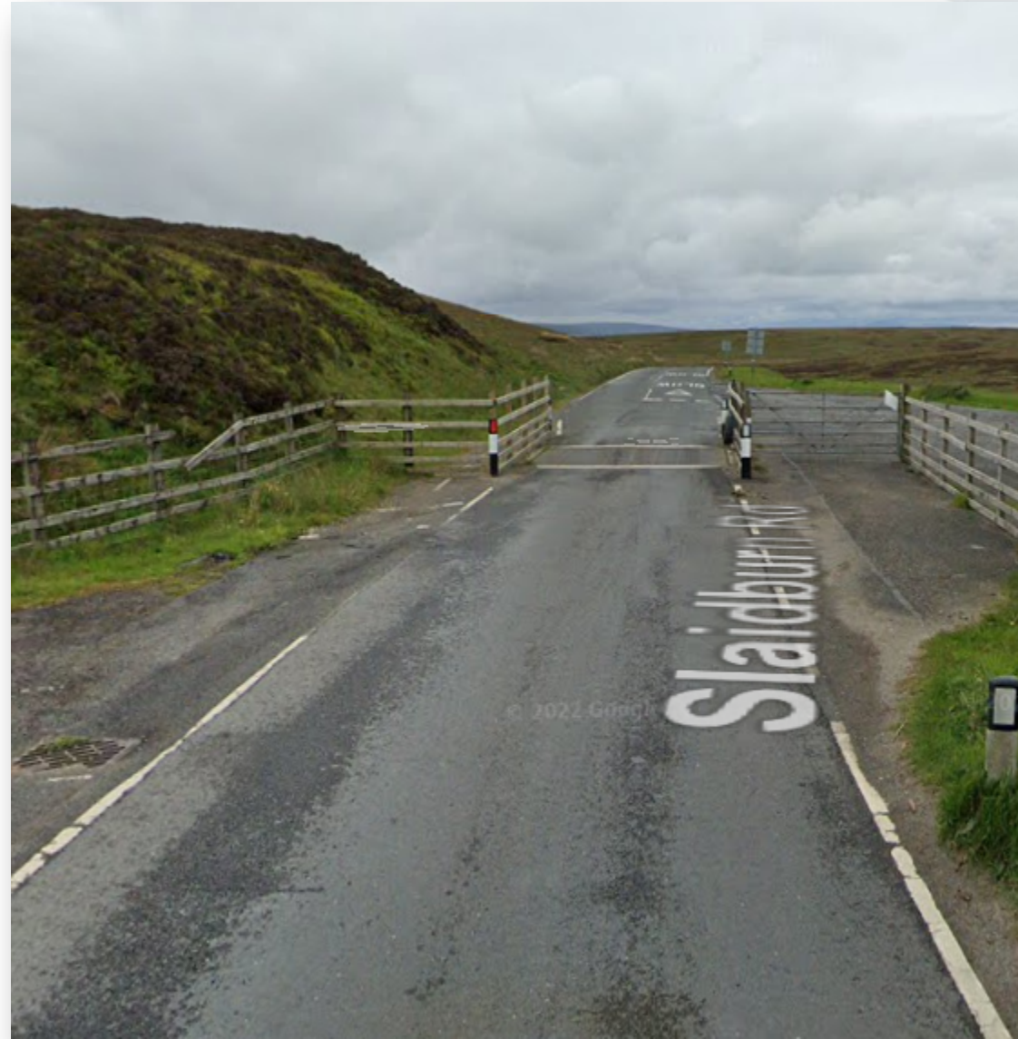
Slaidburn Road at the top of Waddington Fell