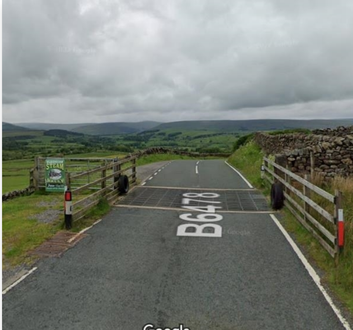
Slaidburn Road heading towards Newton