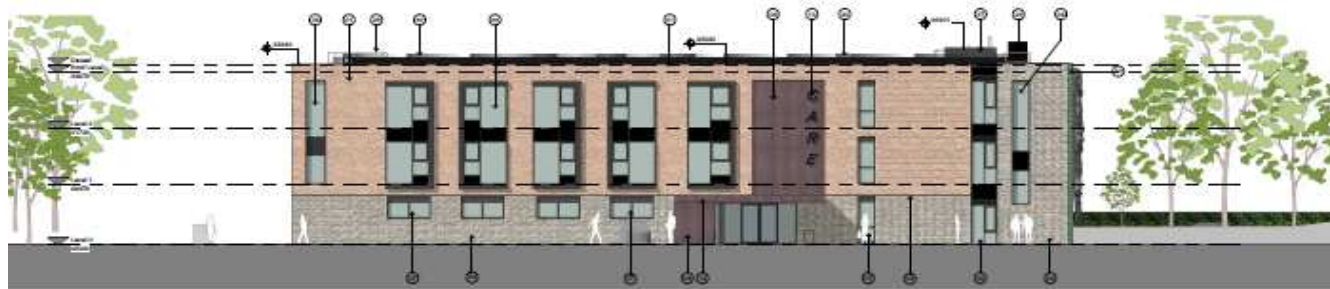
1 | Proposed South West Elevation 1:100