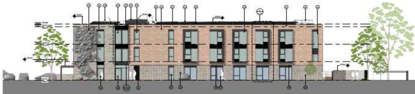
2 | Proposed South East Elevation 1:100