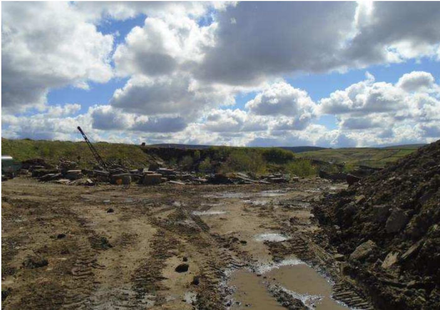
Catlow East (looking east from western side)