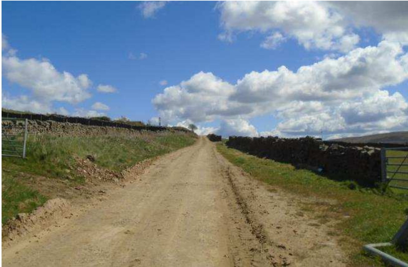
Crawshaw Lane access