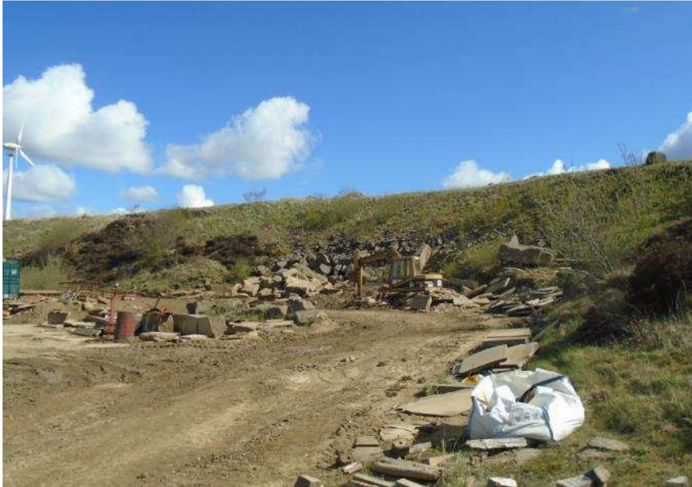
Catlow East (eastern slope)