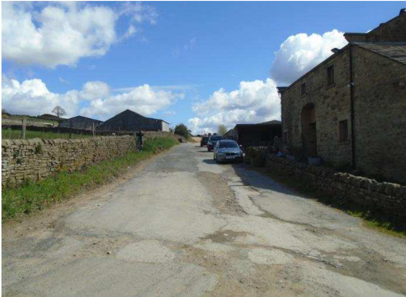
Crawshaw Lane at the junction with Southfield Lane