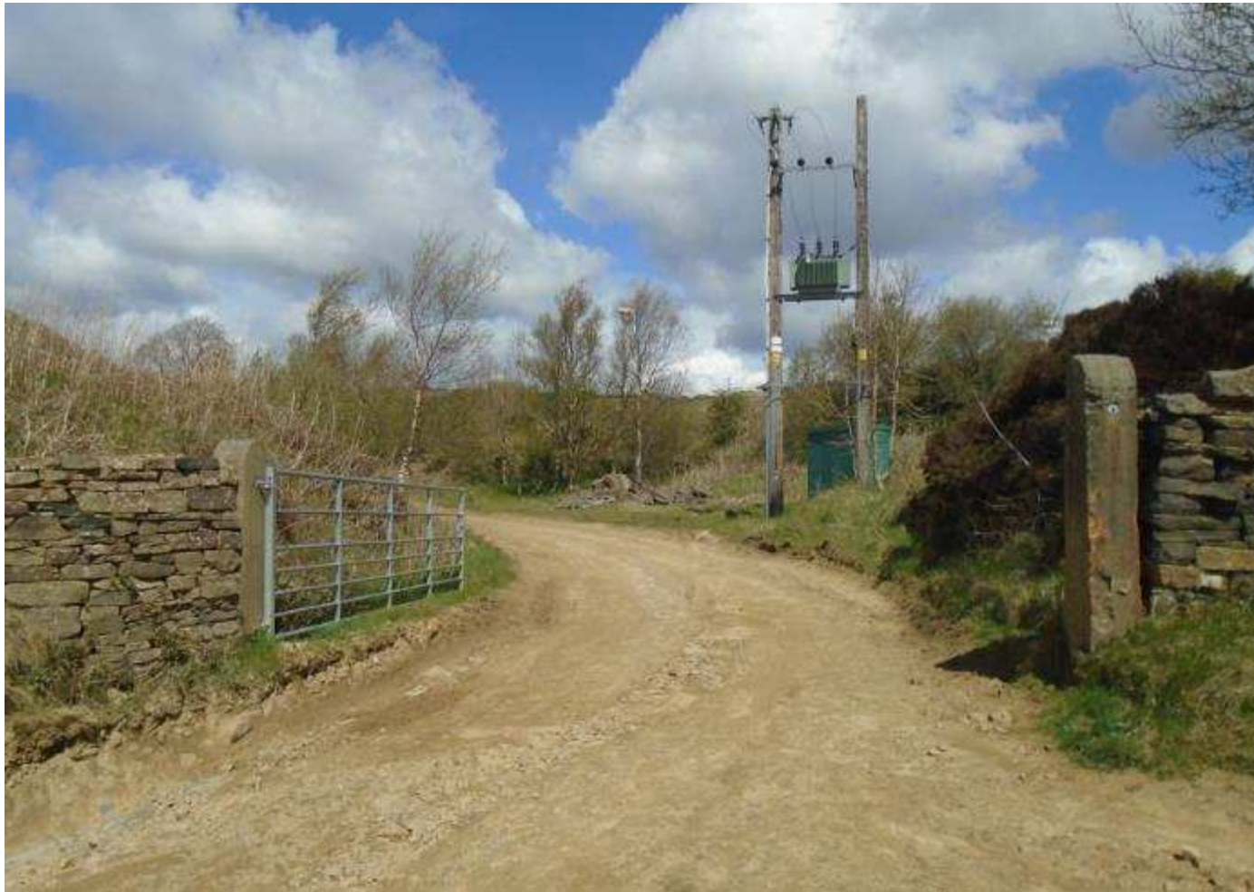
Catlow East quarry entrance