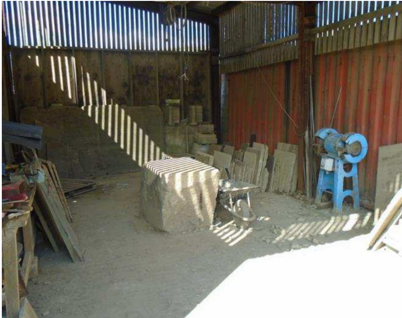
Catlow East (cutting shed)