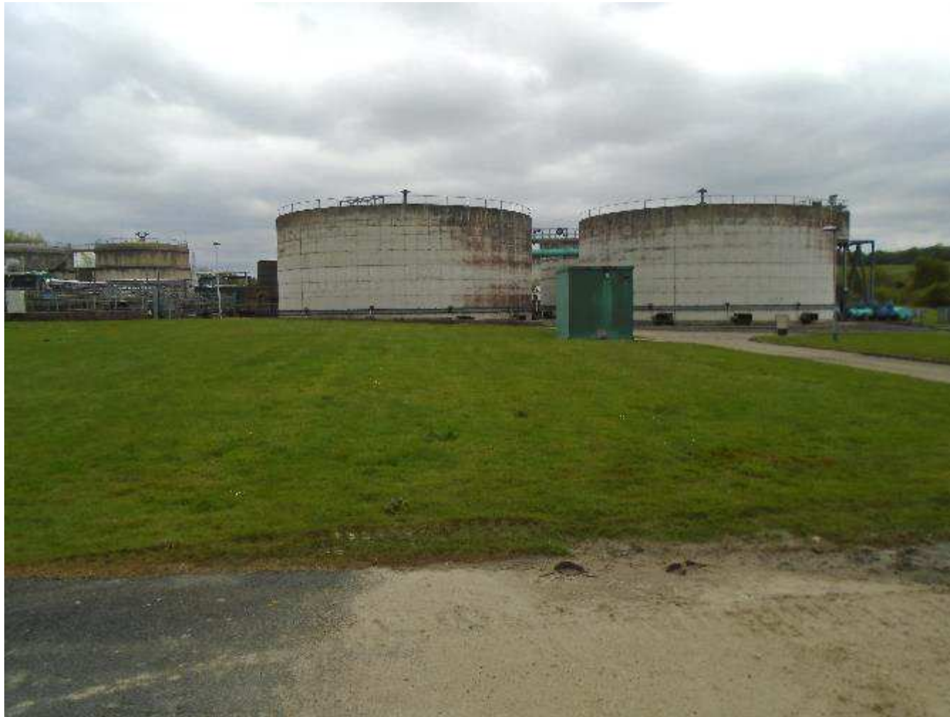
Location for the sludge thickening building and polymer dosing kiosk