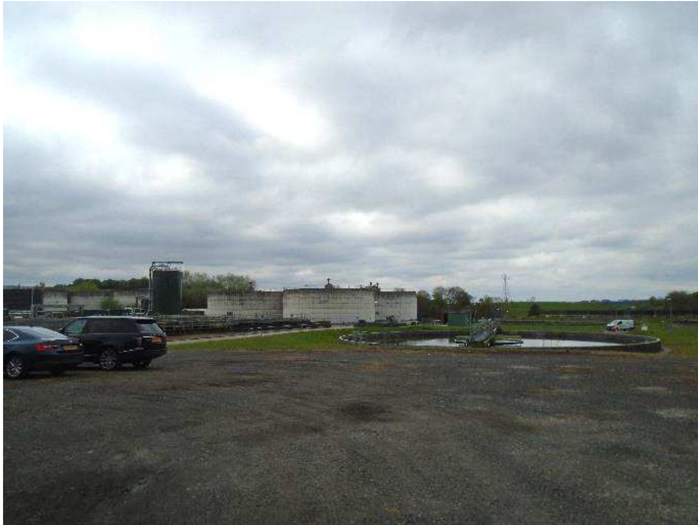
Location for the Biomag complex