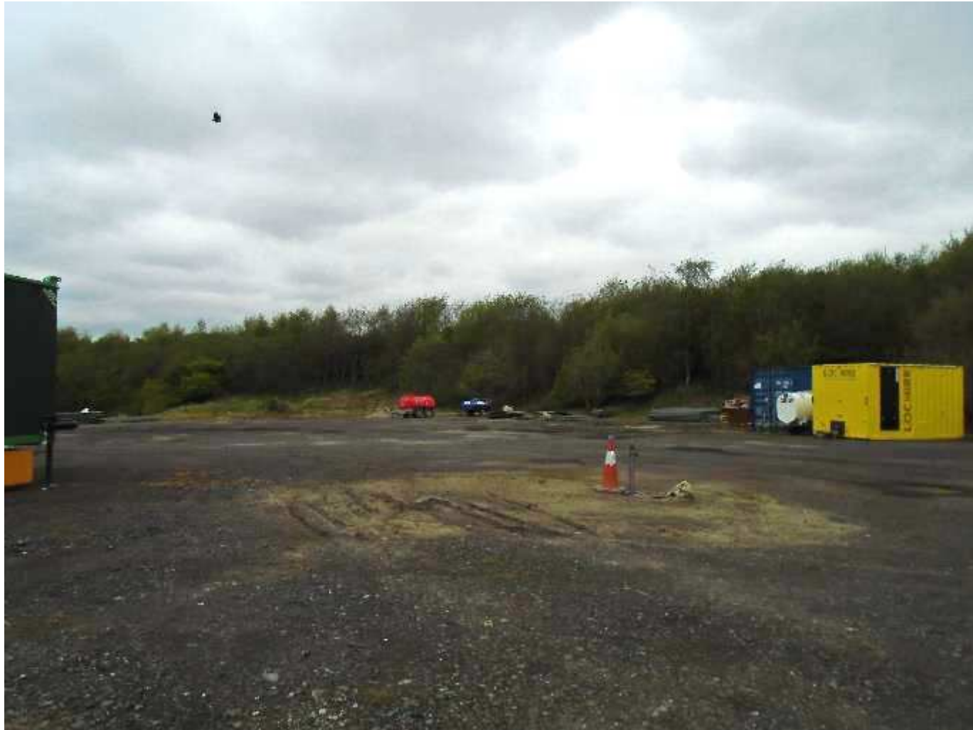
Location for the Biomag complex