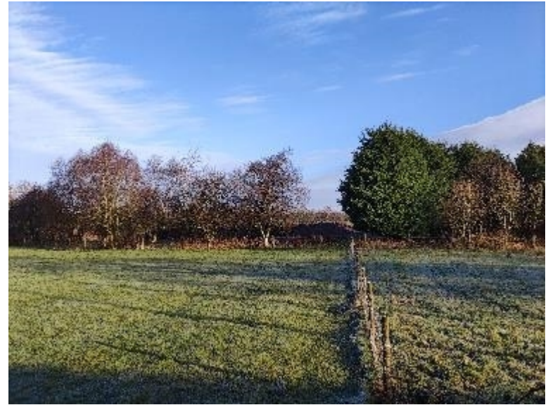
View of site from Preston Road, to the south