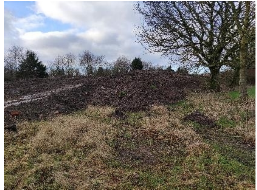
Landscape bund currently under construction