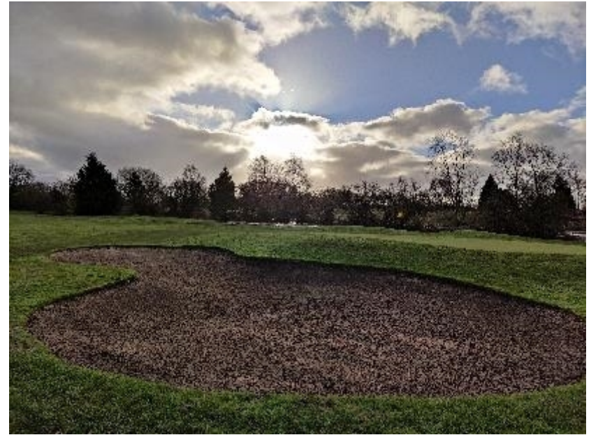
View from existing golf course southwards, towards works