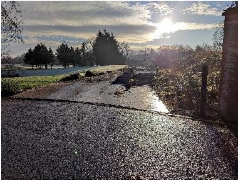
Wheel wash at entrance