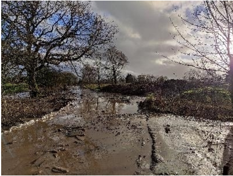
View from site entrance eastwards