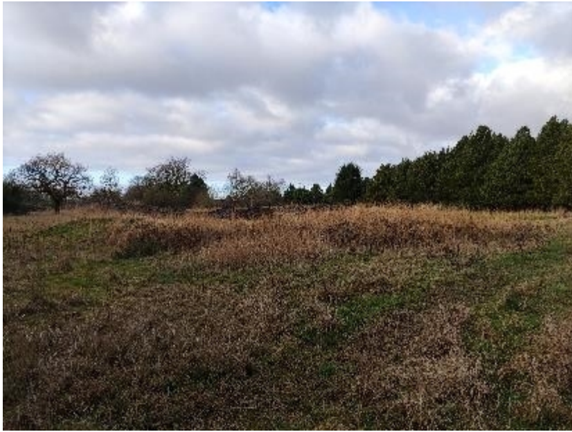
View within site from north, looking south