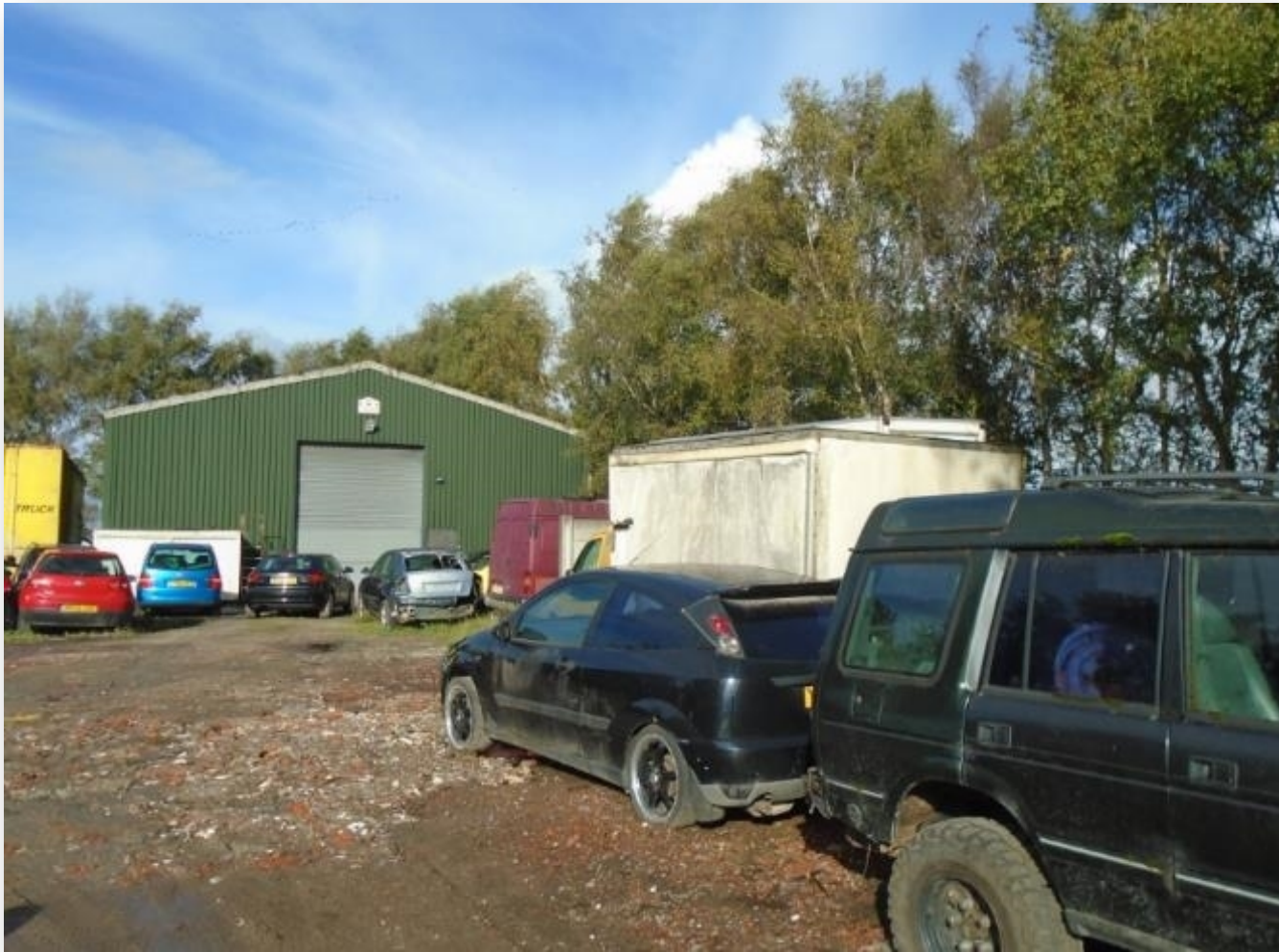
Storage area and building outside application site