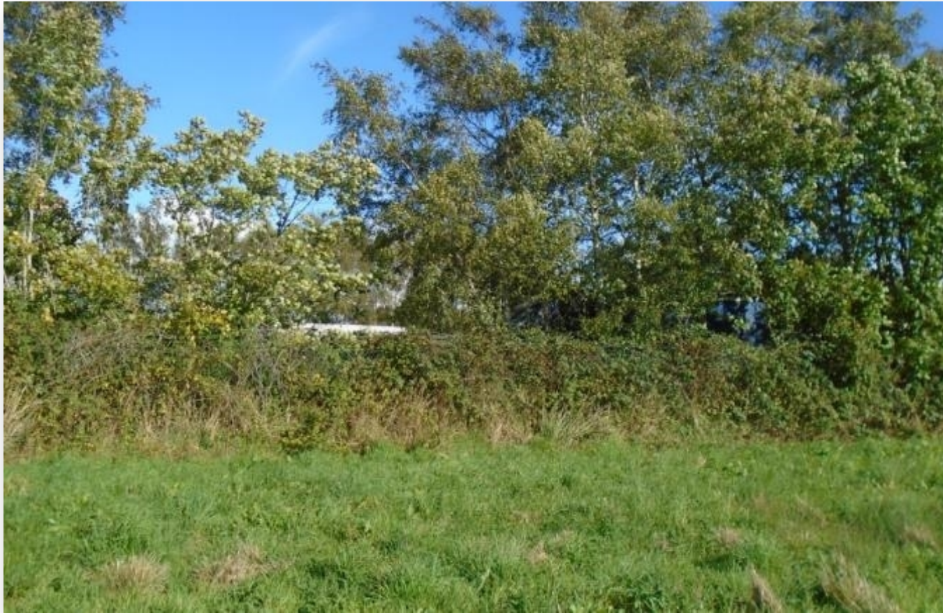
View from the west looking towards the site