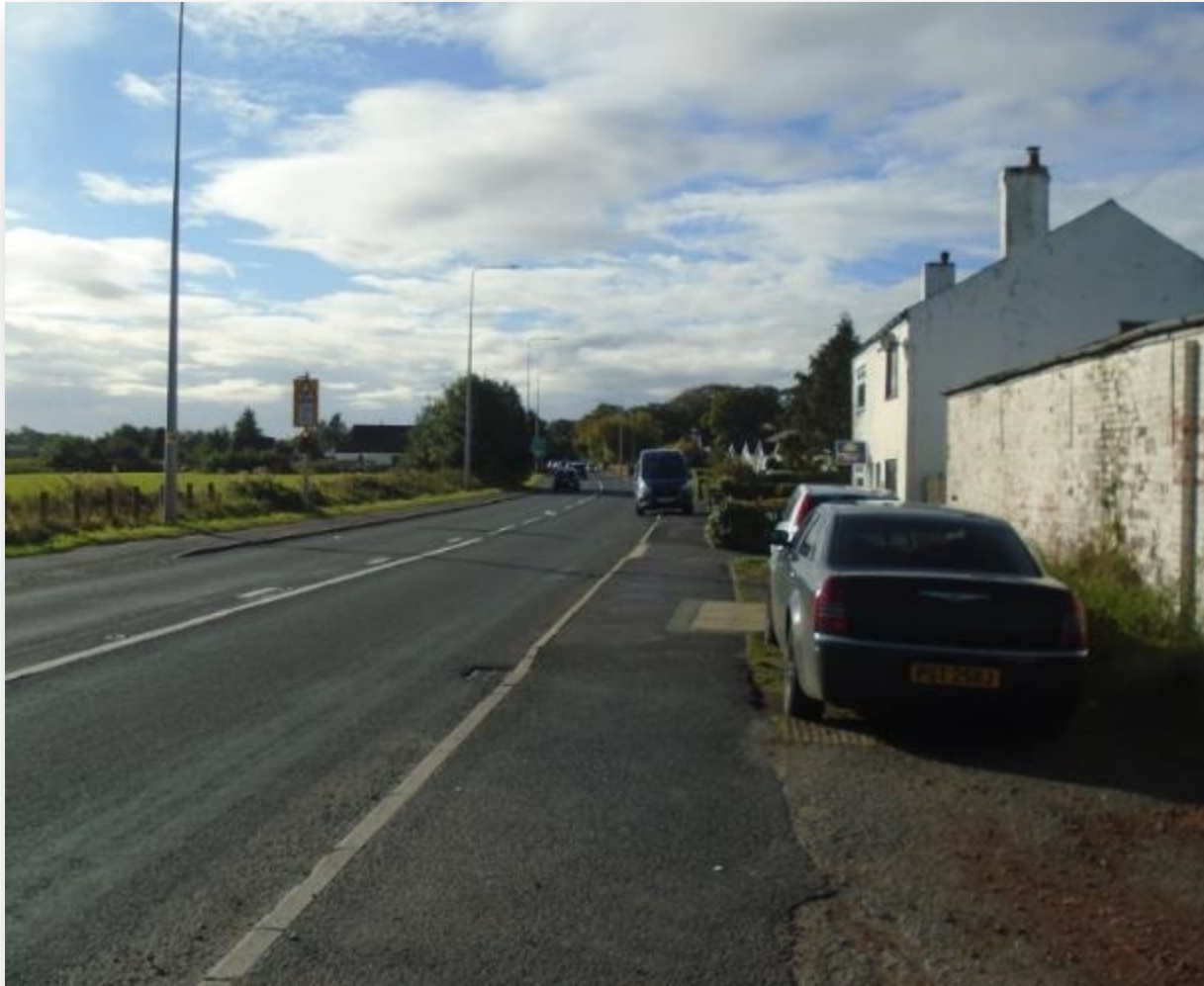
Looking south along Southport Road from the site access