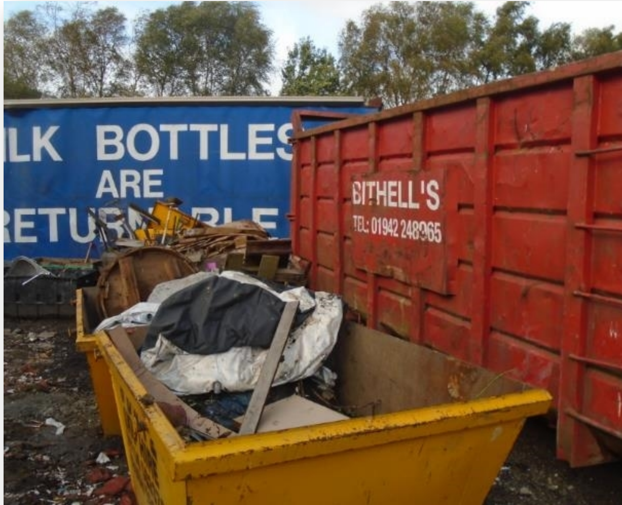
Typical skip sorting