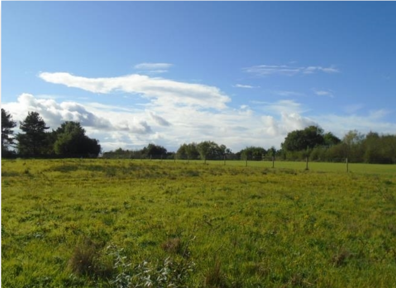
Land to the west of the site