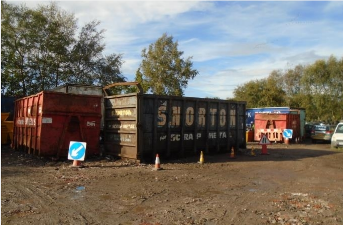
Containers for sorted/separated waste