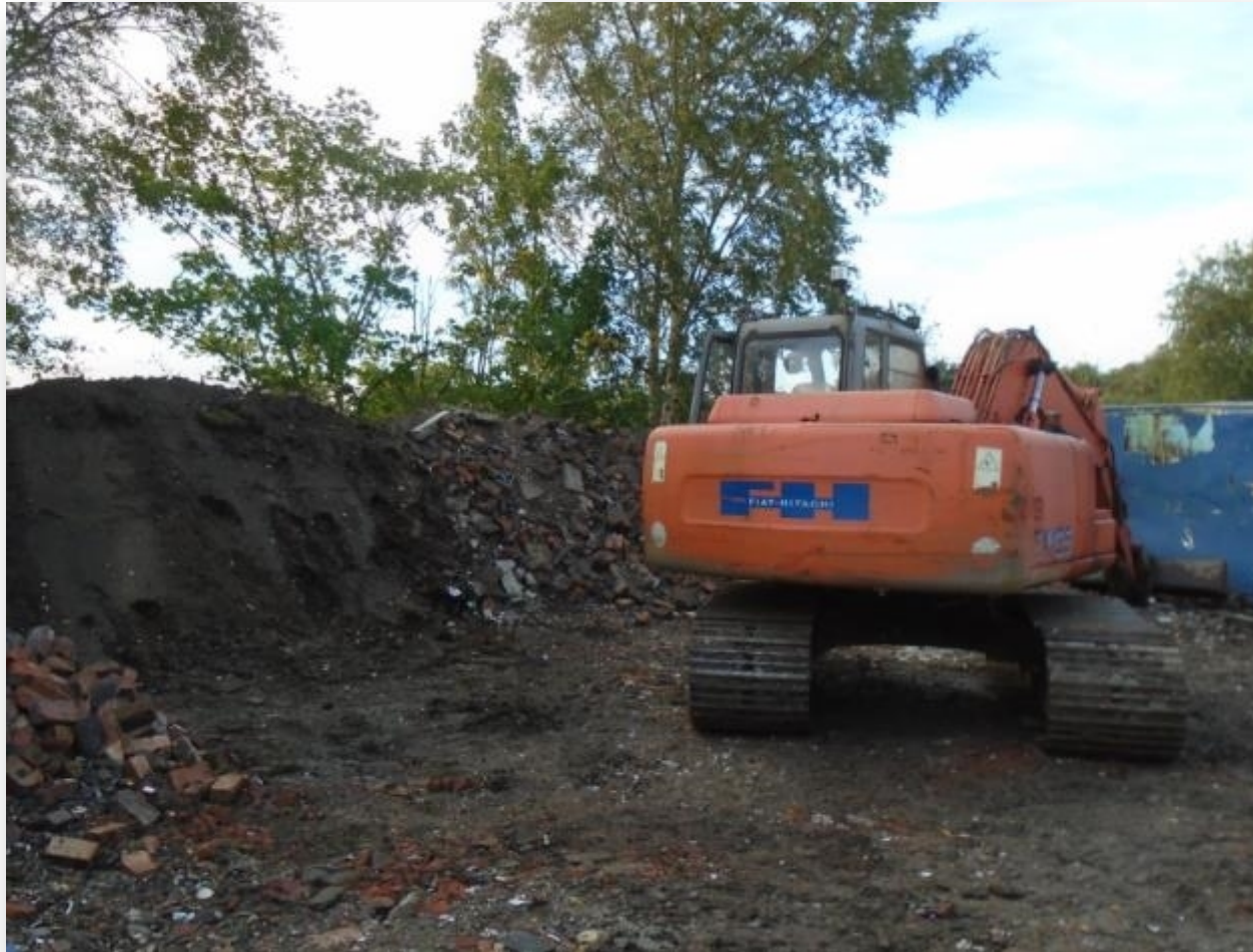
Aggregate/soil storage area