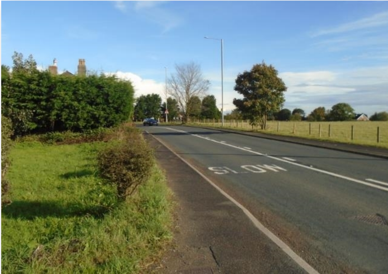
Looking north along Southport Road from the site access