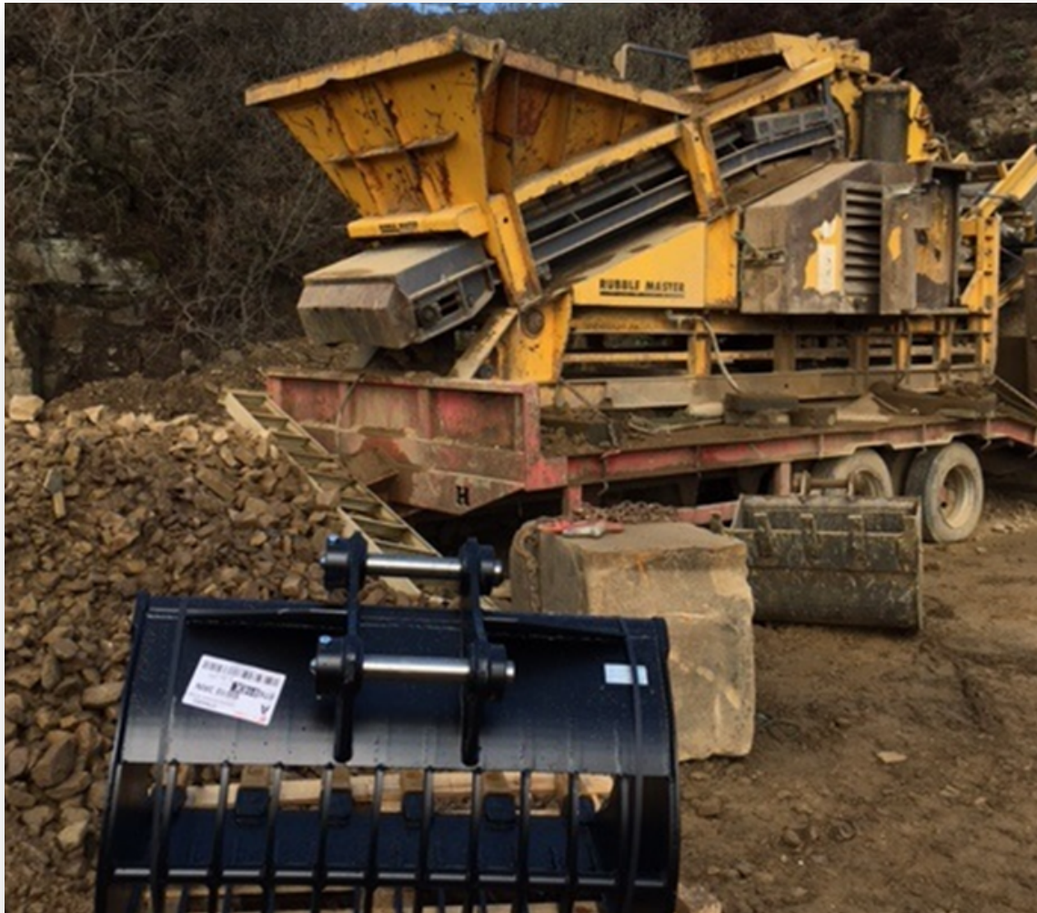
Catlow East crushing plant