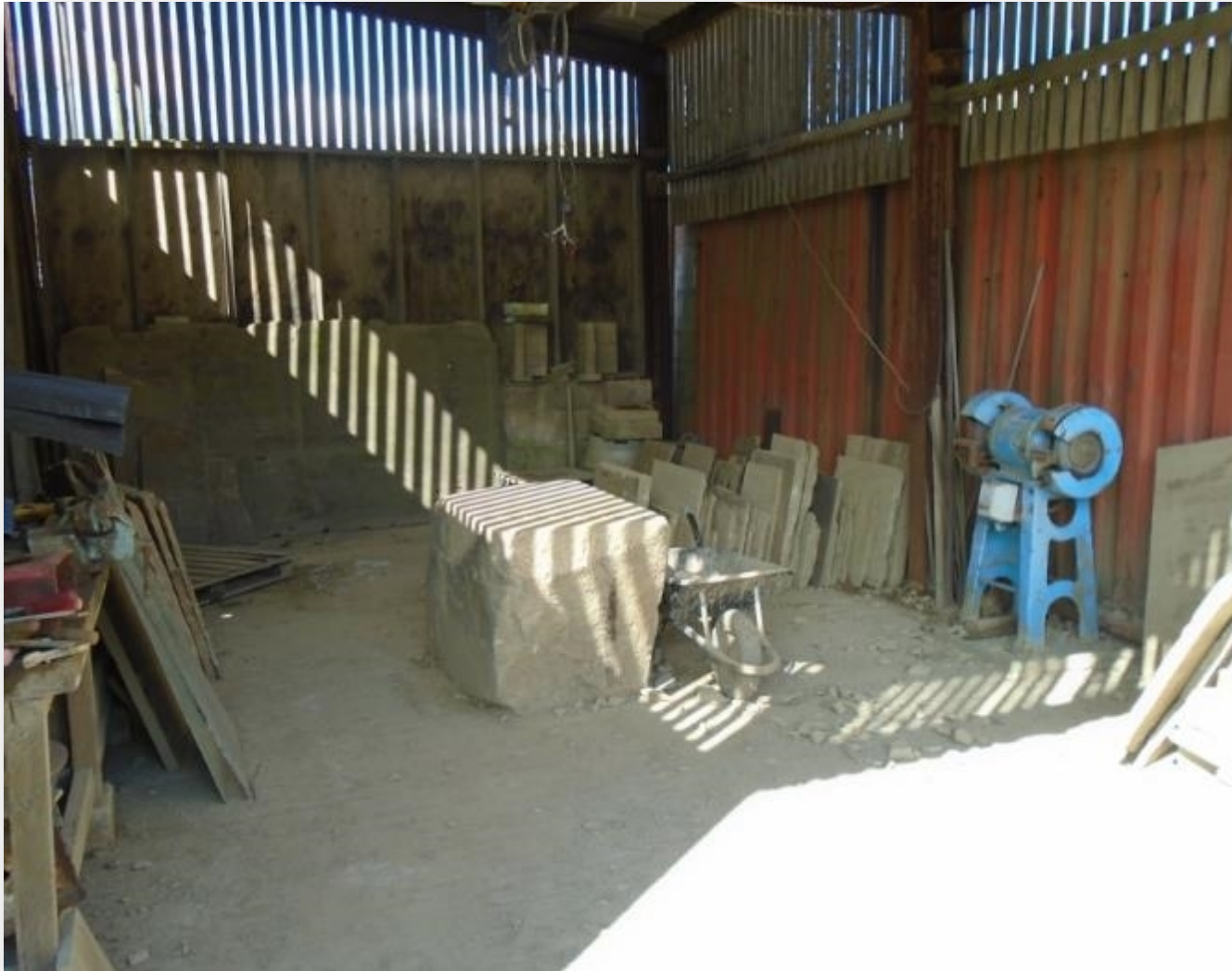
Catlow East (cutting shed)