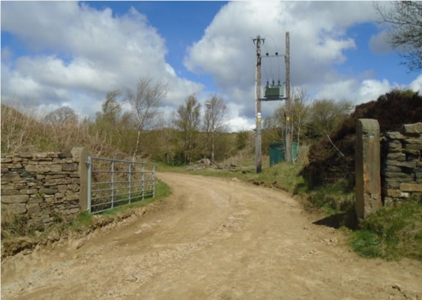
Catlow East quarry entrance