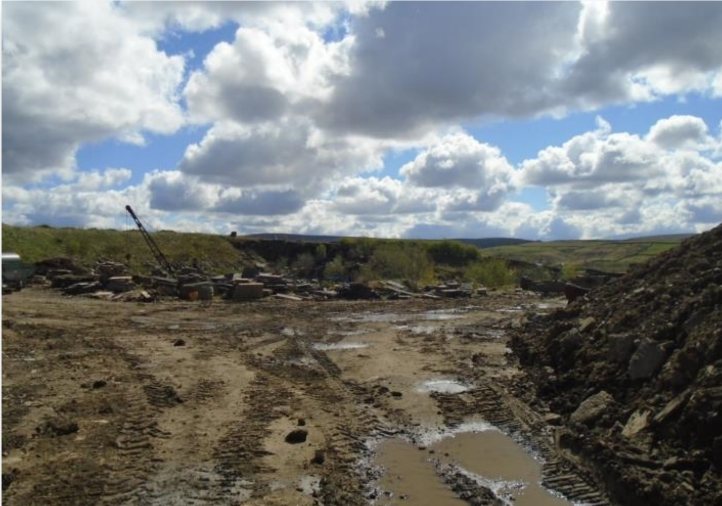
Catlow East (looking east from western side)