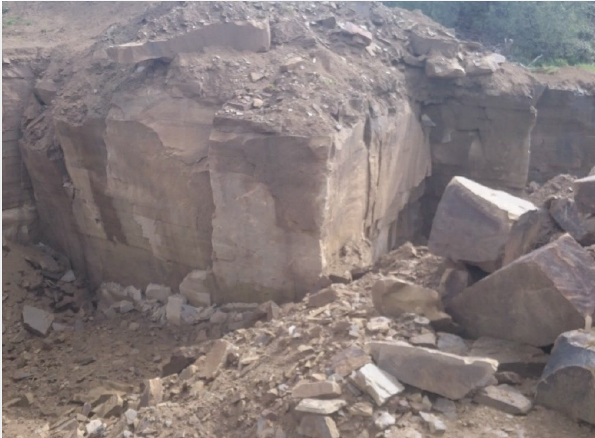
Block stone working in Catlow West