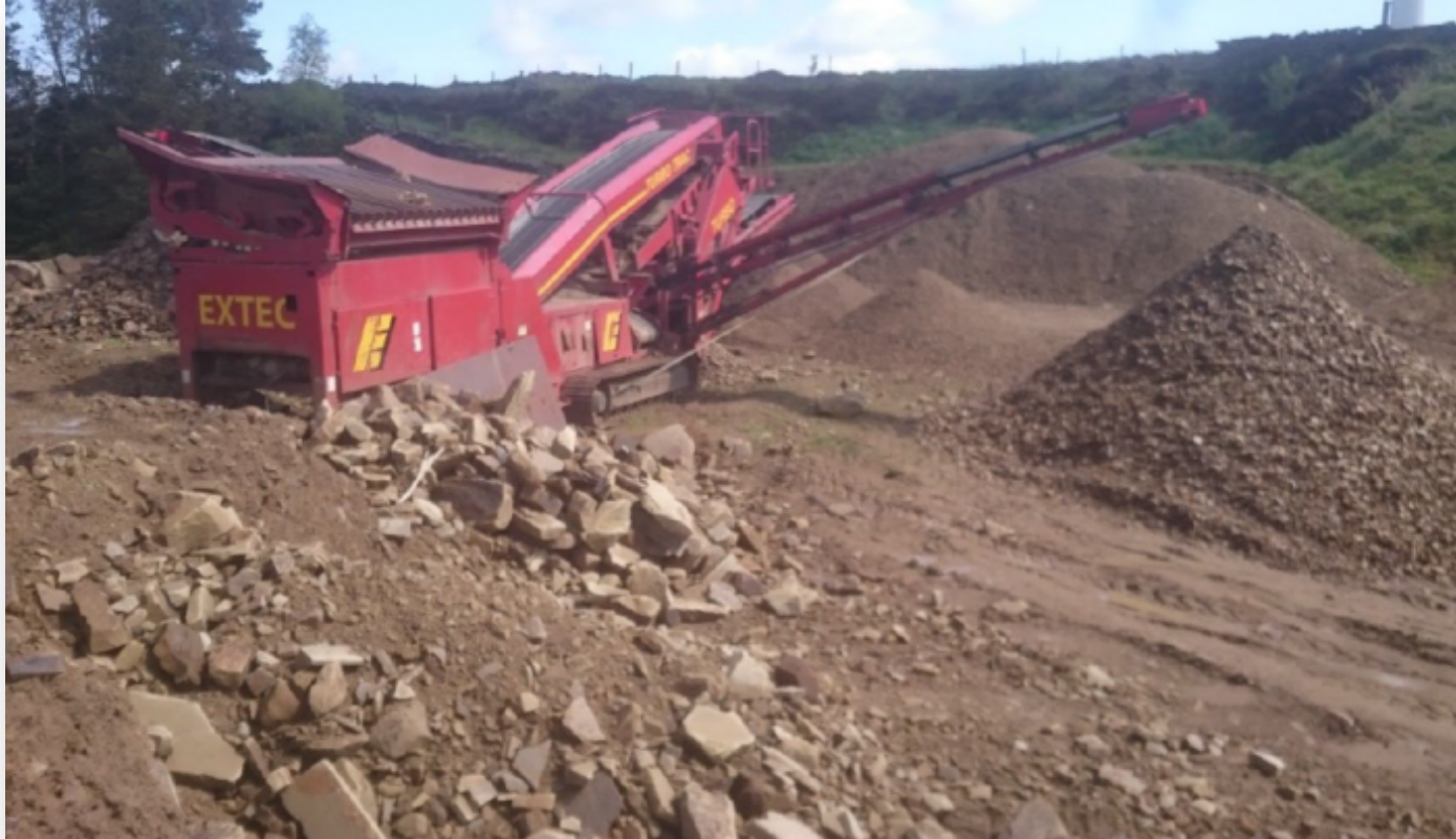
Catlow West powerscreen