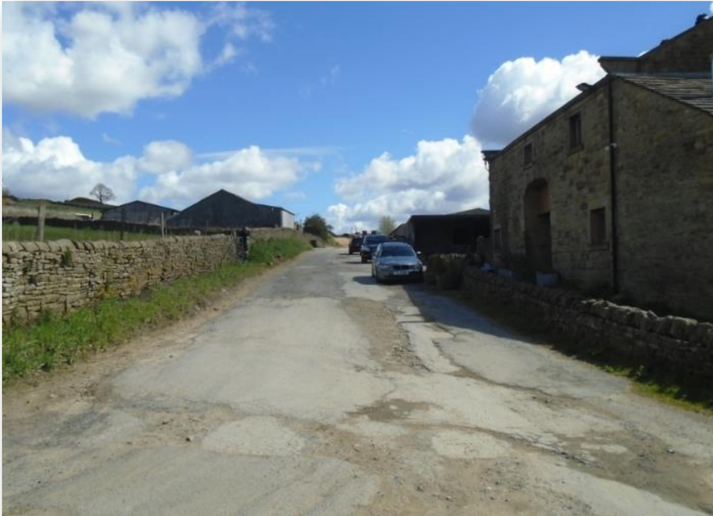
Crawshaw Lane at the junction with Southfield Lane