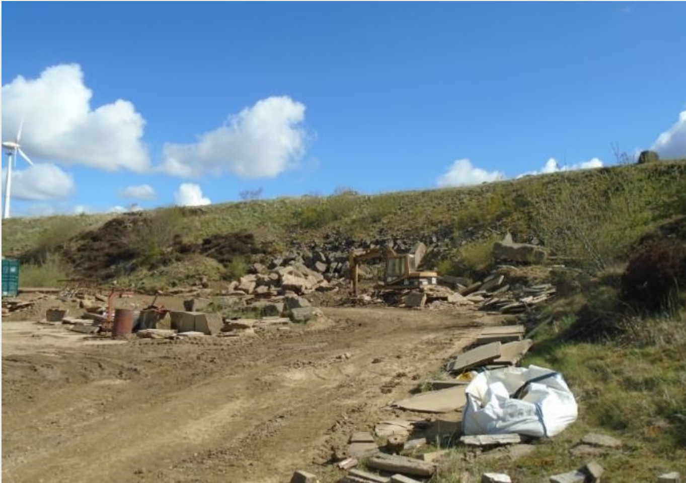
Catlow East (eastern slope)