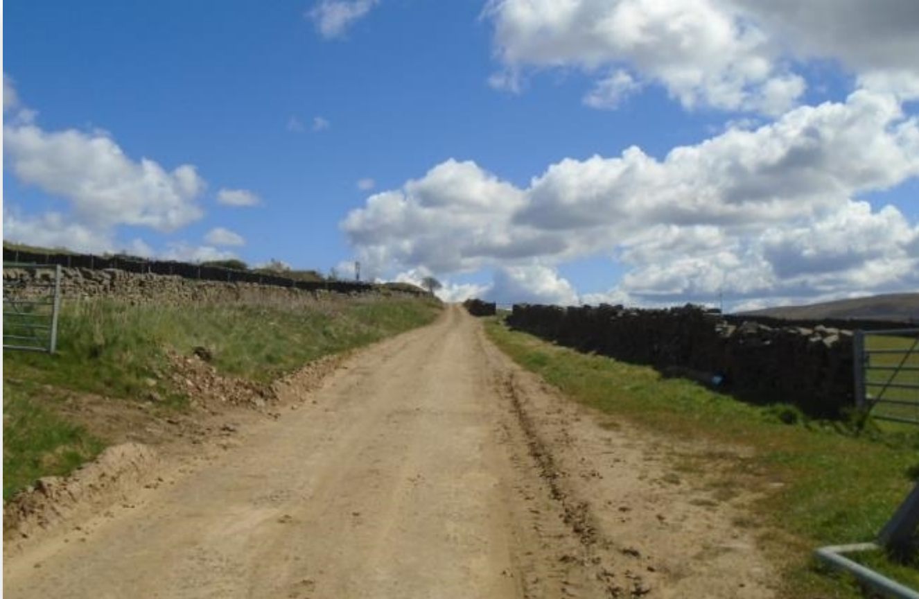
Crawshaw Lane access