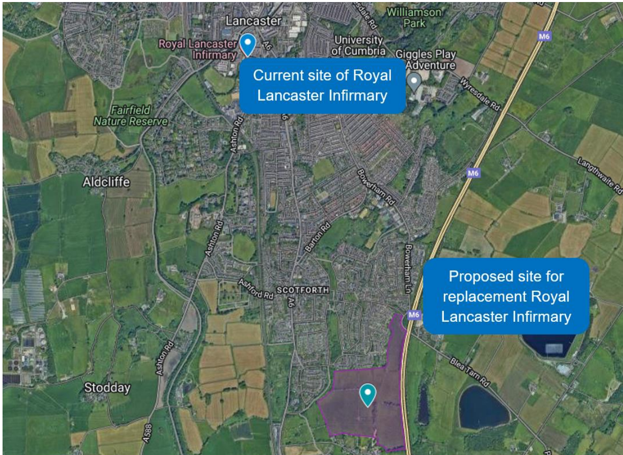
Above: Map showing proposed site for replacement Royal Lancaster Infirmary in relation to the existing Royal Lancaster Infirmary site. (Image credit: Google, 2024).