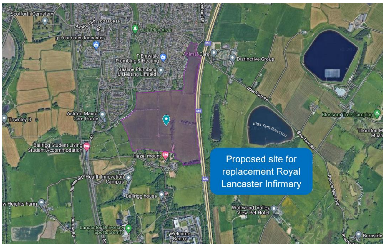
Above: Map showing proposed site for replacement Royal Lancaster Infirmary. (Image credit: Google, 2024).